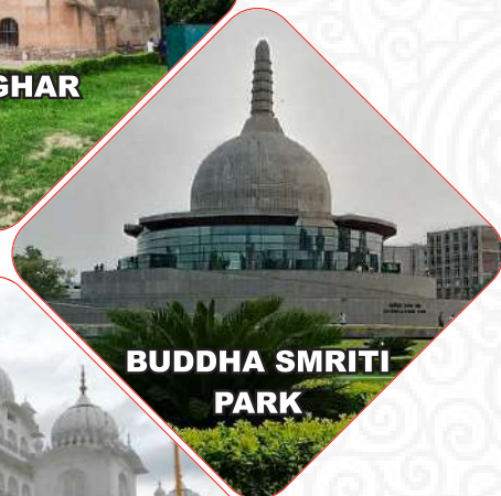
BUDDHA SMRITI PARK