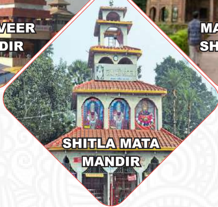
SHITLA MATA MANDIR