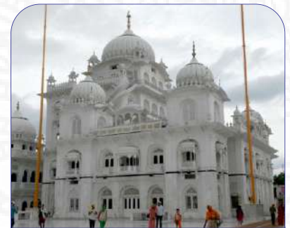
Takht Sri Harmandir Ji Birth Place of Guru Gobind Singh

Bodhgaya, Nalanda, Rajgir, Pawapuri, Vaishali etc.