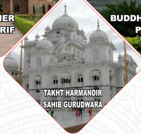
TAKHT HARMANDIR SAHIB GURUDWARA