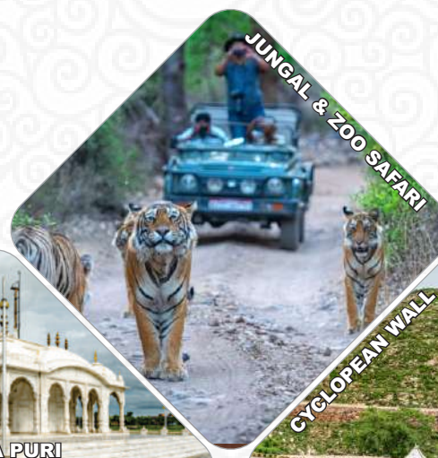
JUNGAL & ZOO SAFARI